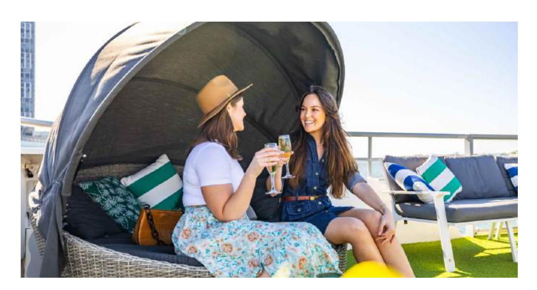
River Cruises (Morning/Lunch/Afternoon / Dinner)